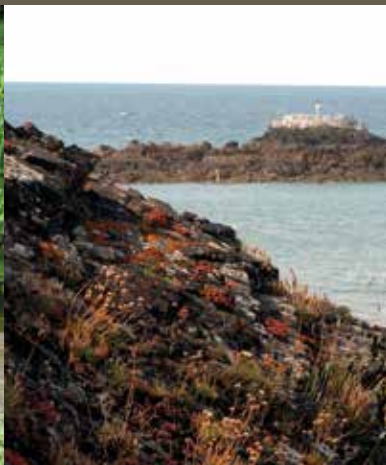
Rocher Martin (Martin rock)