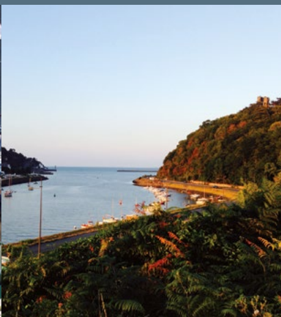
The Tour de Cesson watches over the port Entrance to the Légué port