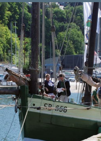
Le Grand Léjon, Traditional sailing boat

At the mouth of the coastal river of Gouet, a port in the past oriented towards large-scale fishing, has evolved towards pleasure and commercial activities. Restricted by its bay head position in the line of the powerful tide, the Légué port was built from the desire of the boat-builders to gain even more access to the sea. Follow the quays and lift your gaze. On both sides of the marina, the maritime history reveals itself little by little.