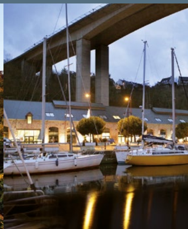
Le Carré Rosengart, Quai Armez