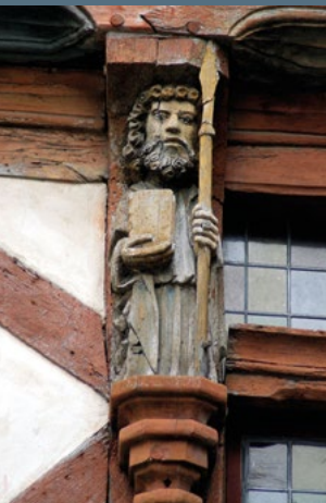
Maison Le Ribault, Place au Lin