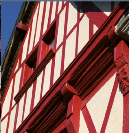
Maison de la Barrière, Rue de Gouët