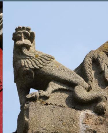
Hôtel des ducs de Bretagne, Place Louis Guilloux